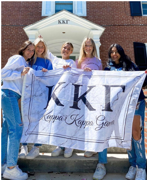
Filming for recruitment video

Are there any interesting photos from this year to share? e.g., screen shots of virtual meetings, pictures of chapter events that followed all public health guidelines (mask wearing, physical distancing, etc), pictures of masks, drive-thru bid days, etc.