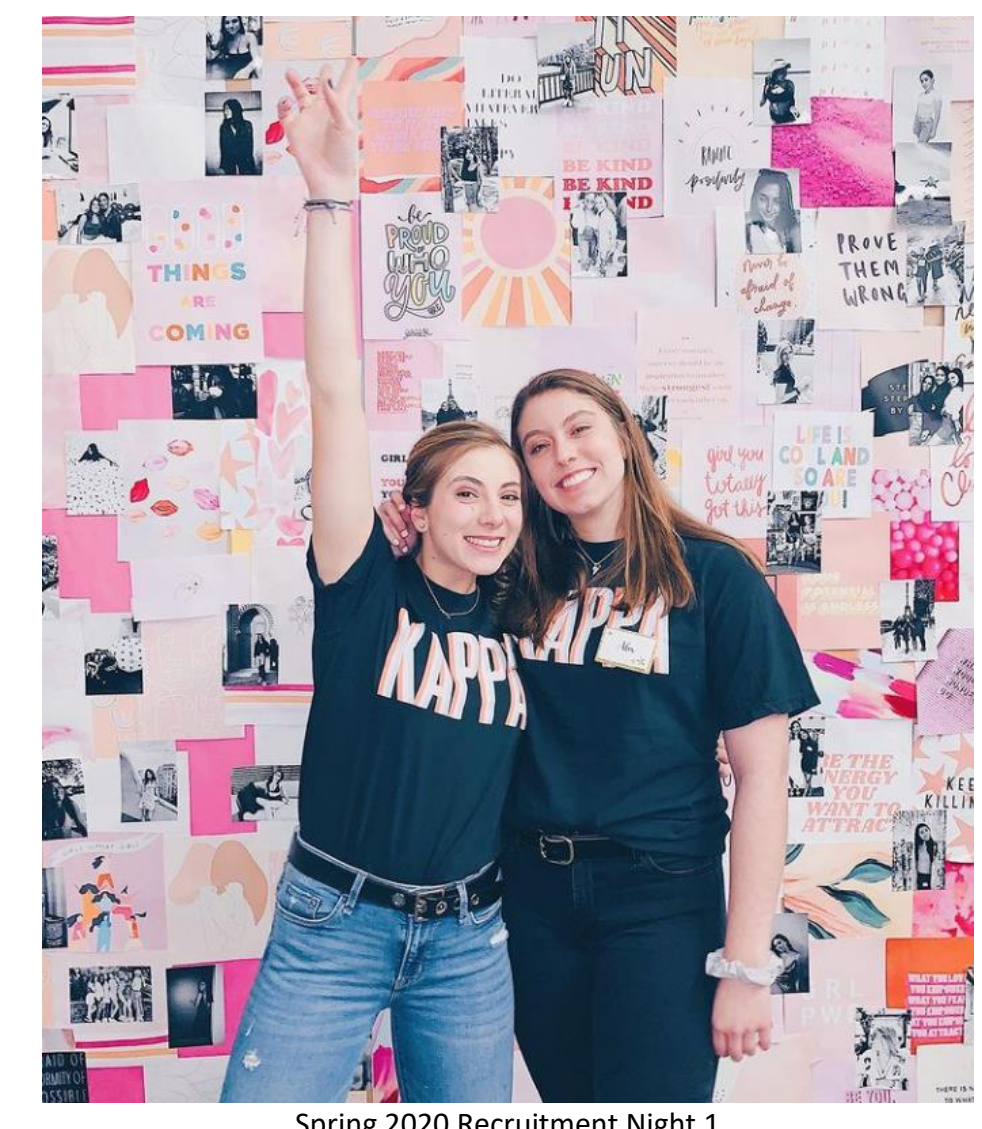
Spring 2020 Recruitment Night 1

Are there any interesting photos in the chapter archives that you would like to share? e.g., screenshots of virtual meetings, pictures of chapter events that followed all public health guidelines (mask wearing, physical distancing, etc), pictures of masks, drive-thru bid days, etc.