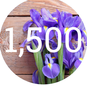
irises used for décor during Convention