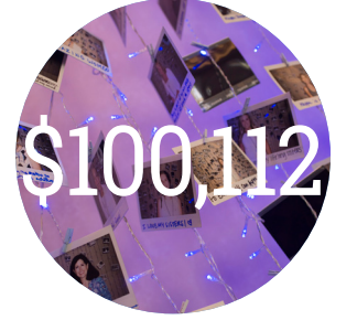
raised at the Foundation Tribute Table