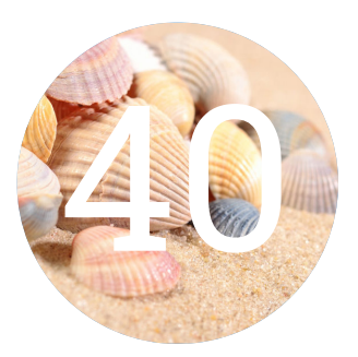
pounds of sea shells and sand for centerpieces