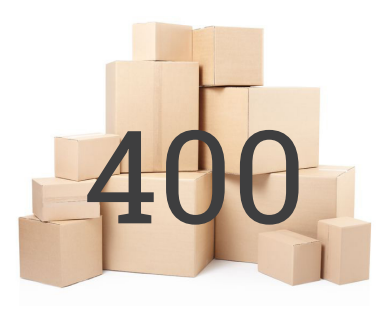
boxes shipped from HQ to San Diego