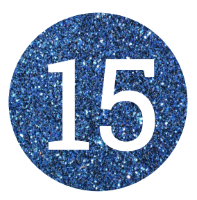
pounds of glitter used

2000 yoga mats used in the Foundation's Fleurever Flexible yoga sessions