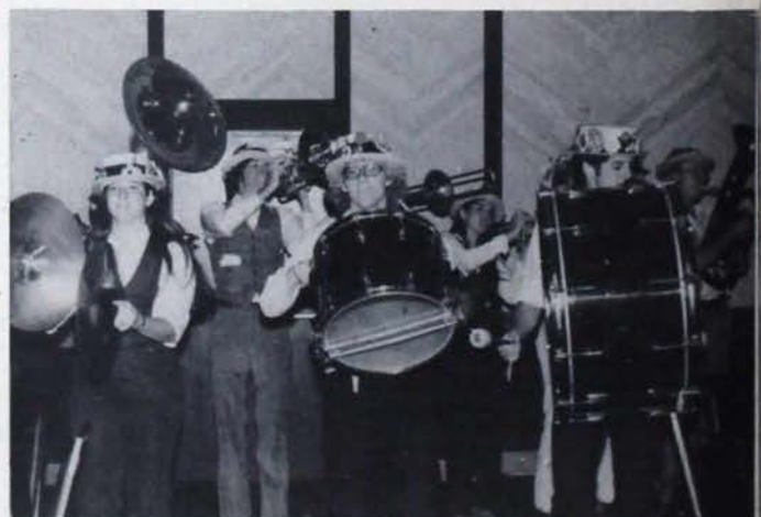
The Cal StrawHat Band made a surprise appearance.

The banquet was held at the Marriott Inn in Berkeley with about 180 attending. Guests were surprised by visits from the Cal StrawHat Band and Oshi, the silent Cal mascot, who really got the evening off to an enthusiastic beginning. Seating was