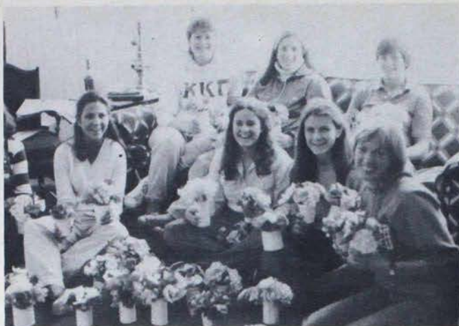
Philanthropy flowers at Delta Gamma chapter — Last spring the Kappas at Michigan State made 38 May Day flower arrangements for the Ingahm County Extended Care Facility. The flowers were delivered on the first of May, and the patients were delighted and cheered to find the arrangements on their dining room tables!