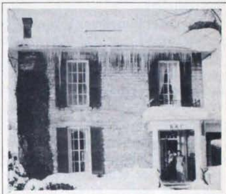
Rho Chapter House

"The history book of Kappa Alpha Theta also dates the advent of Kappa Kappa Gamma to Ohio Wesleyan to at least the fall of 1880. It states: all went well until the fall of 1880, when it was a rude awakening when one winter day the exciting news was announced that Kappa Kappa Gamma had established a chapter at Ohio Wesleyan, and the