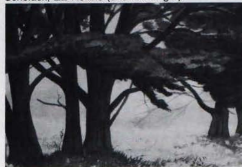
"Coast Cypress" water color by Pat Van Schoiack, ΔE-Rollins (shown at right).