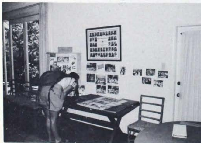
Scrapbooks and old photos displayed in chapter room.

From the first notification of the upcoming birthday, to the last tearful goodbyes on May 22, 1980, Pi Deuteron Chapter at the University of California, Berkeley, actives and alumnae worked to create a special celebration of Pi's first 100 years.