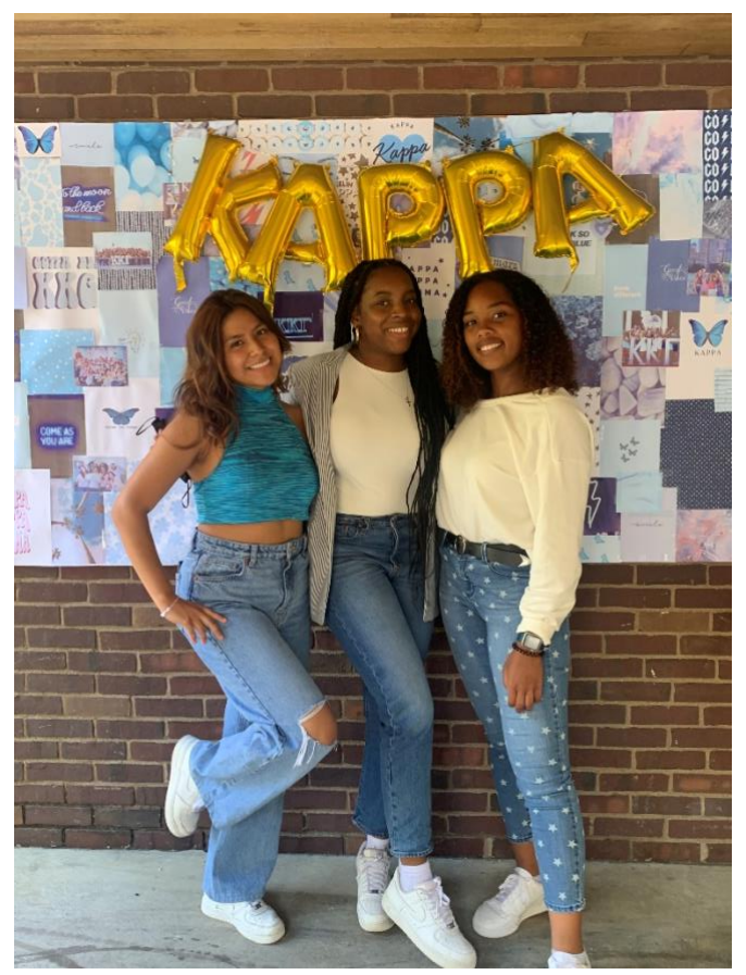
Founder's Day Cookie Decorating and Photos