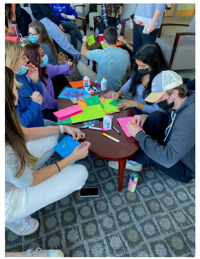
Kards with Sigma Phi Epsilon