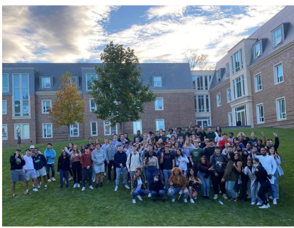
DEI Event with Origins of Necessary Equality (ONE) and Delta Tau Delta